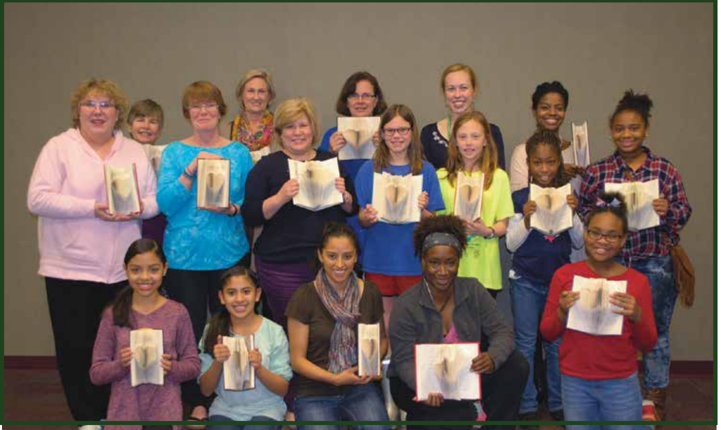
Top left: Animal Allies, a new teen service club, rolled newspapers for the Greater Birmingham Humane Society. Top right: The Children's Department took crafts, games and stories to local Farmer's Markets. Bottom: The Book Art program attendees learned to fold a heart into old novels.