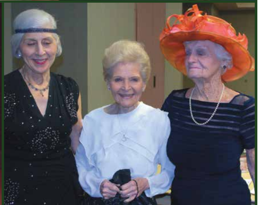
Top: The crowd at Minimalist Bartending learned how to use household items to craft cocktails. Bottom Left: Super Science Night entertained families with fun experiments. Bottom Right: Stylish Downton Abbey Tea and Trivia contestants dressed in period costumes.