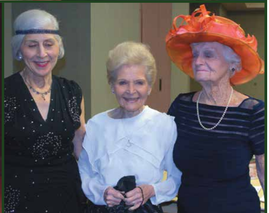
Top: The crowd at Minimalist Bartending learned how to use household items to craft cocktails. Bottom Left: Super Science Night entertained families with fun experiments. Bottom Right: Stylish Downton Abbey Tea and Trivia contestants dressed in period costumes.