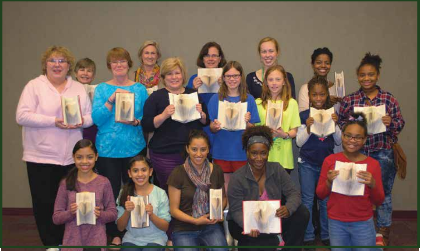
Top left: Animal Allies, a new teen service club, rolled newspapers for the Greater Birmingham Humane Society. Top right: The Children's Department took crafts, games and stories to local Farmer's Markets. Bottom: The Book Art program attendees learned to fold a heart into old novels.