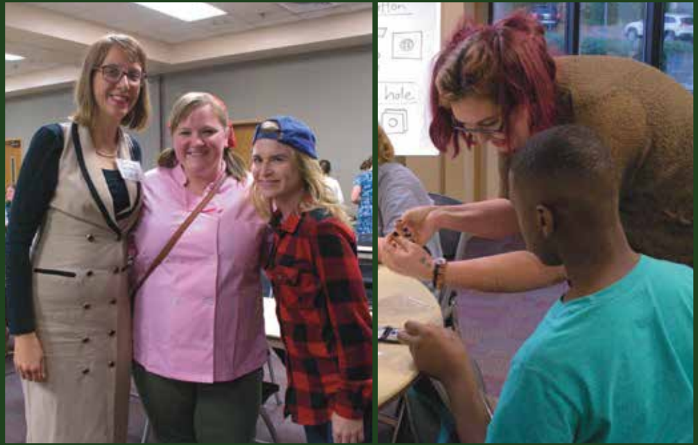
Top: Lunch N Learn Investing Workshop, a partnership between the Library and Edward Jones. Bottom Left: Gilmore Girls Trivia Contestants dressed up as the tv show characters. Bottom Right: Teens learned basic sewing skills at Sew What!.

Additionally, Library staff answered 186,330 questions about resources, programs, and materials.